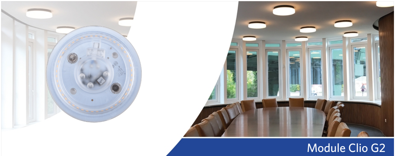
Module Clio G2