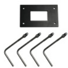
703098000300 LEDBollard-Luke-E Concrete-Mounting-Kit