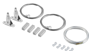
599006009000 LEDLima Suspension-Kit